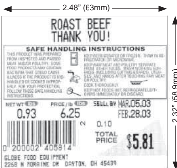
Safe Handling Label (Part E12)