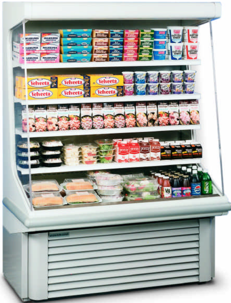
ACCENT SERIES™ Specialty Vertical Merchandisers Shown with optional end bumpers and one additional shelf